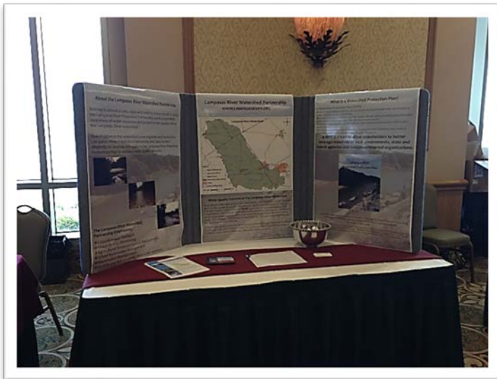
Figure 6 Exhibitor's booth hosted by the Watershed Coordinator at the Annual Meeting of SWCD Directors in Corpus Christi in 2014.

This annual meeting provides Soil and Water Conservation District (SWCD) Directors, SWCD employees, and others the opportunity to examine issues relevant to the conservation of the