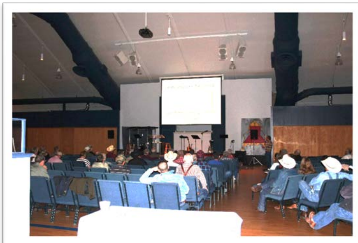
Figure 3 Participants learn about control measures for feral hog populations at the Feral Hog Management Workshop on October 23, 2013.

Feral hogs were identified as a primary concern by the Partnership. Feral hog populations have grown dramatically in the state of Texas over the past 10 years and the Partnership expressed concern about how the rising population numbers would impact the local water quality if left