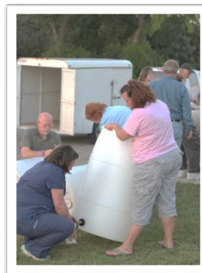
Figure 4 Two participants attach a hose bib to a barrel at the Rainwater Harvesting for Homeowners program on April 22, 2014.

The Watershed Coordinator also worked with AgriLife Extension – Dallas and the LCHEC to offer a Big Tank Rainwater Harvesting class. This event was canceled prior to public announcement because LCHEC was not able to raise the necessary funds to purchase the large rain collection tank. This program will be rescheduled in the future,